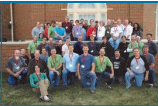
In October 2010, Diabetes Dayton was chosen as a recipient of the South West Ohio Give Camp and a group of a hard working volunteers helped us build and develop a brand new website from the ground up.

It is because of the support of these dedicated individuals that Diabetes Dayton is able to successfully carry out its mission.